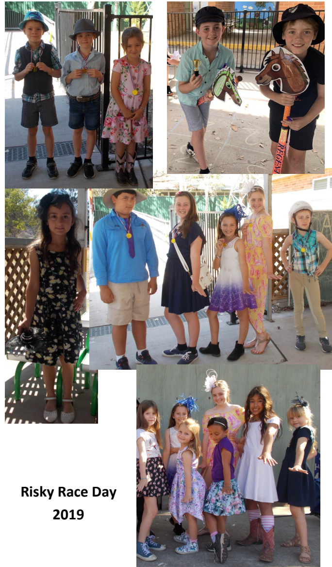
Risky Race Day 2019

Another great Risky Cup was held on Tuesday with fashions on the field and novelty race winners. Students and staff did a great job of dressing up for the day and enjoying the fun together.