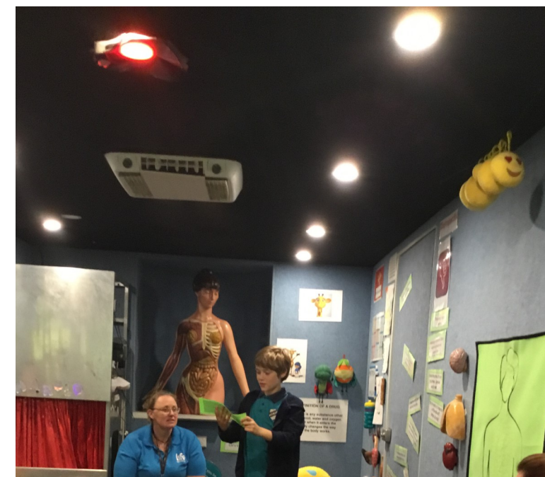
ABOVE - Students learning in the Life Education Van

Thank you to Afterlee Public School for hosting our Healthy Harold excursion this year. We all had a great day of friendship and learning. Students enjoyed their sessions - Kindy to year 2 learnt about how to build friendships and care for others, Years 3 and 4 learnt about factors that influence the function of body systems such as exercise and drugs and years 5 and 6 investigated the importance of relationships to our own and other peoples' wellbeing.