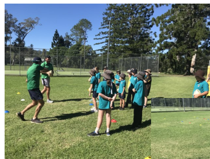
Left - The students learn skills and technique