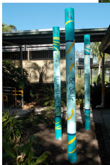
The PBL poles perfectly placed and enhance the entrance of the school