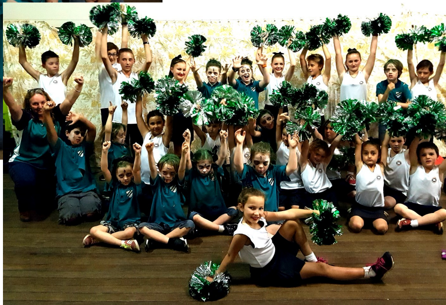
From Zombies to Cheerleaders. The Risk students all fired up backstage waiting for their performance.