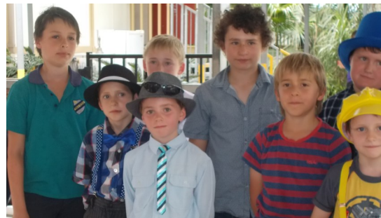
The Best Looking Race day crowd outside of Flemington