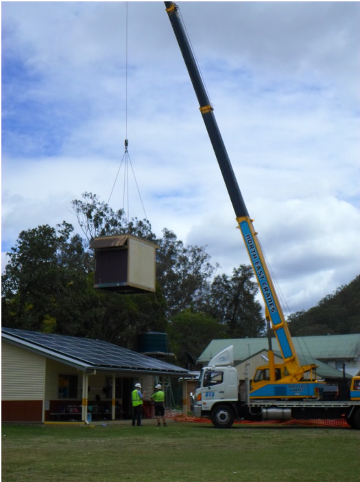
ABOVE & LEFT: The new building arrives (with a lovely mural to boot!) by truck and is lifted into place with cool, calm efficiency.

P & C Meeting 8th Sept 9am All Welcome !