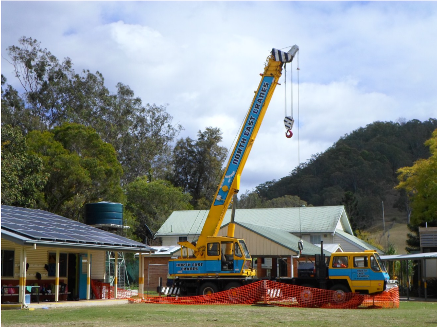
LEFT: The crane is in place while students and staff go down the back yard to get a good view of the event.